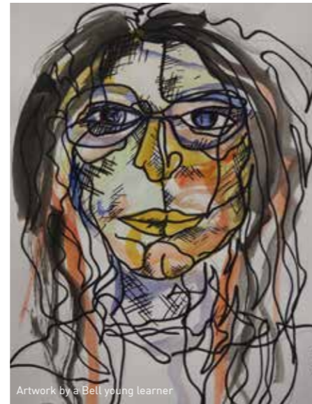
Artwork by a Bell young learner